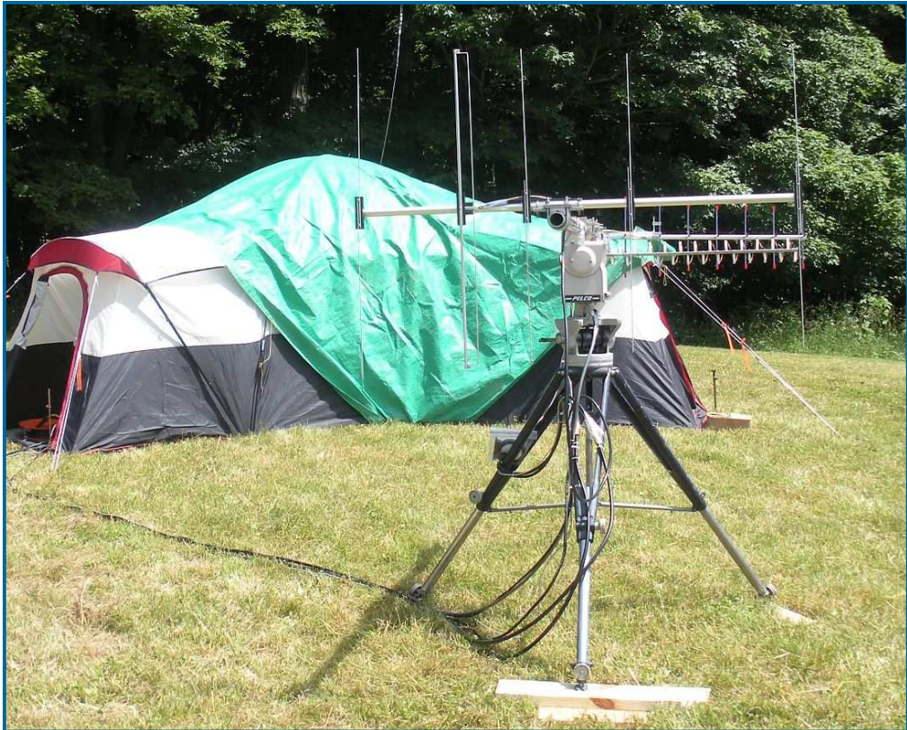
Satellite Antenna and Shack at the NODXA Field Day Site

The ARRL says it's not a contest, perhaps because it's supposed to be an exercise that attracts those who might just be getting started in ham radio. It's a type of entry level contest. No one likes to finish near the end of the pack, but we want all amateurs to participate no matter what their experience level might be. Americans are a competitive people and without a little friendly competition, Field Day would not be the same. Now that we have that out of the way, let's discuss one of the ways to earn extra