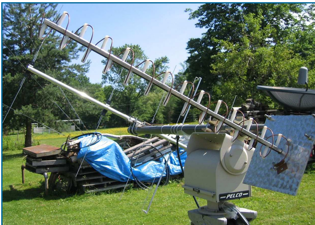
Close-up of the Home-brewed Helical Antenna

This time we concentrated on CW as well as voice, realizing that there are not that many setups that operate on CW on the birds during Field Day. It looked like we were doing well and our score near the end was far more than the year previous. One more pass of VO-52, a linear bird, and it would be over. But about 45 minutes before that pass, the sky opened up and the rain came down heavy for what seemed like forever. That rain cloud just hung over our Field Day site. Later I would learn that areas