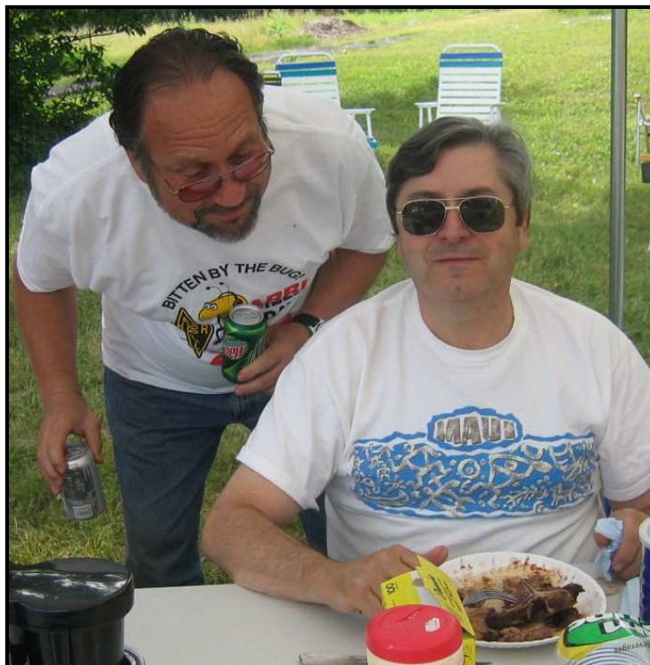
Are you going to eat that?