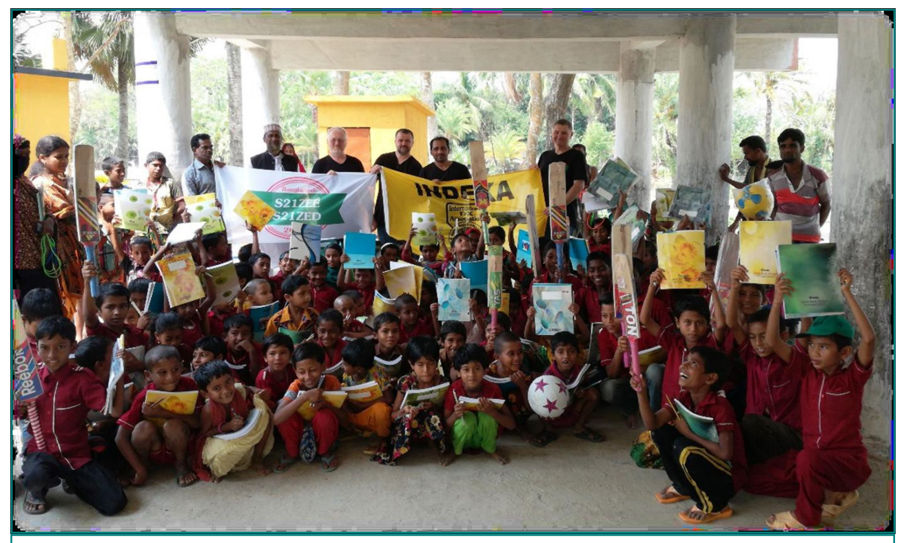
With pupils and teachers in Kuakata's school

more than 250 little hearts and 3 schools in Bangladesh.