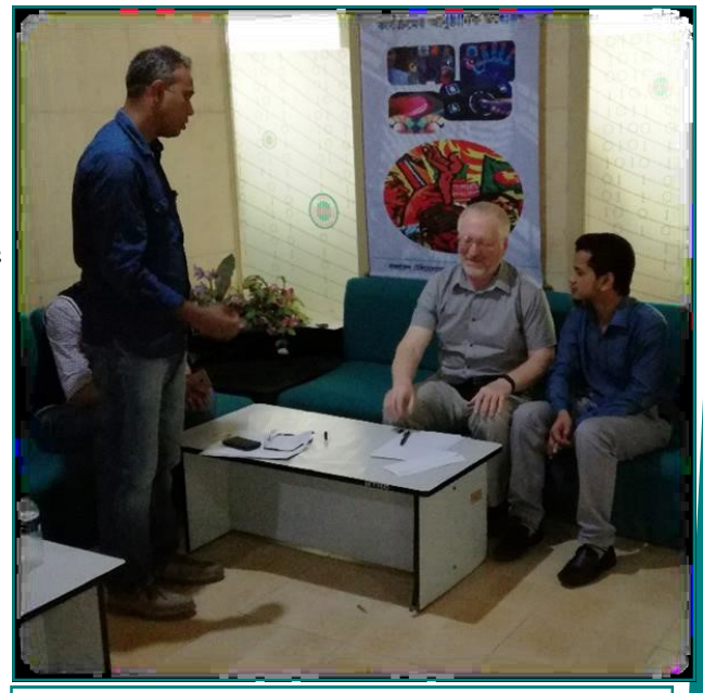
Meeting with BTRC representatives

Next morning we sailed with a small ferry from Dhaka to Barisal and from there drove by bus to Kuakata - the city called Kingdom of the Oceans Daughter. We visited our planned QTH - hotel with small cottages and big field next to them for antennas and the sea just couple hundred meters away. Bangladesh has a lot of natural historic beauties and one of them is The Bay of Bengal which is situated in the south of Bangladesh with many beautiful sea beaches, e.g. Cox's Bazar sea beach, Kuakata sea beach, Patenga