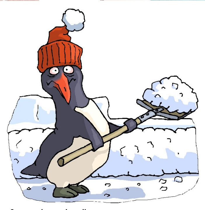
Get ready to shovel!