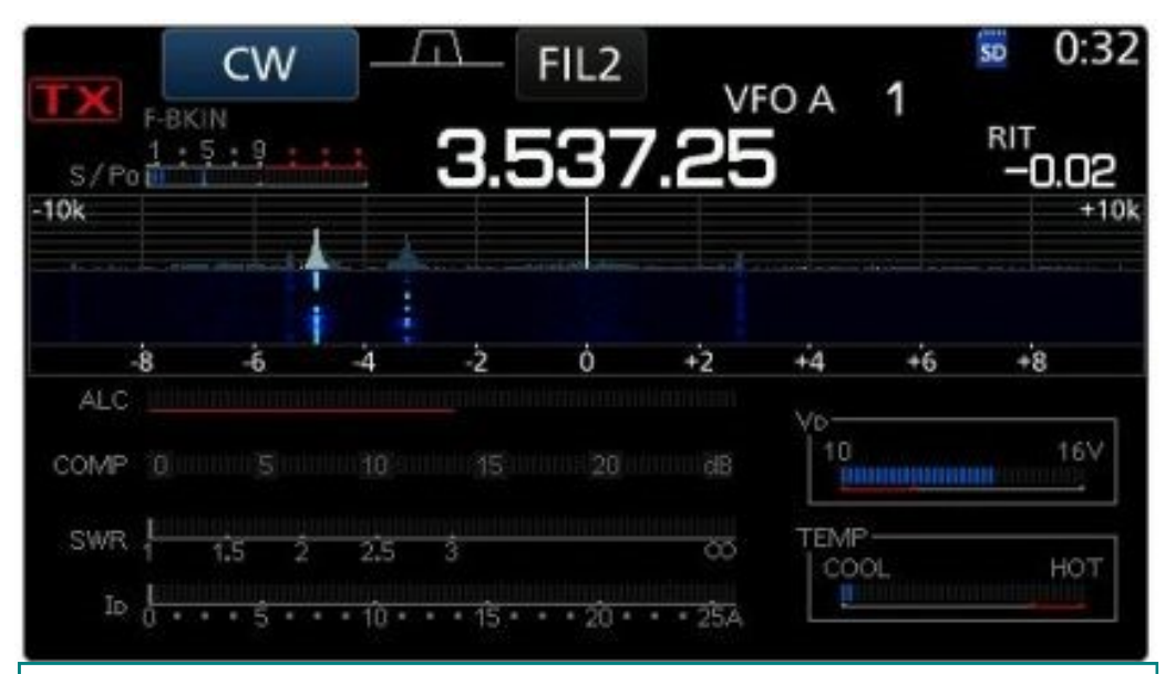
Screen shot taken last night while operating 80m CW. The ability to take screen shots is one of the features that I like about the IC-7300.

This all works pretty much the same way that my IC-746PRO works, except that instead of pushing buttons on the radio's front panel, you're touching the touch screen. I like the fact that the operation is so similar to my IC-746PRO. It made it much easier to learn how to operate the new radio.