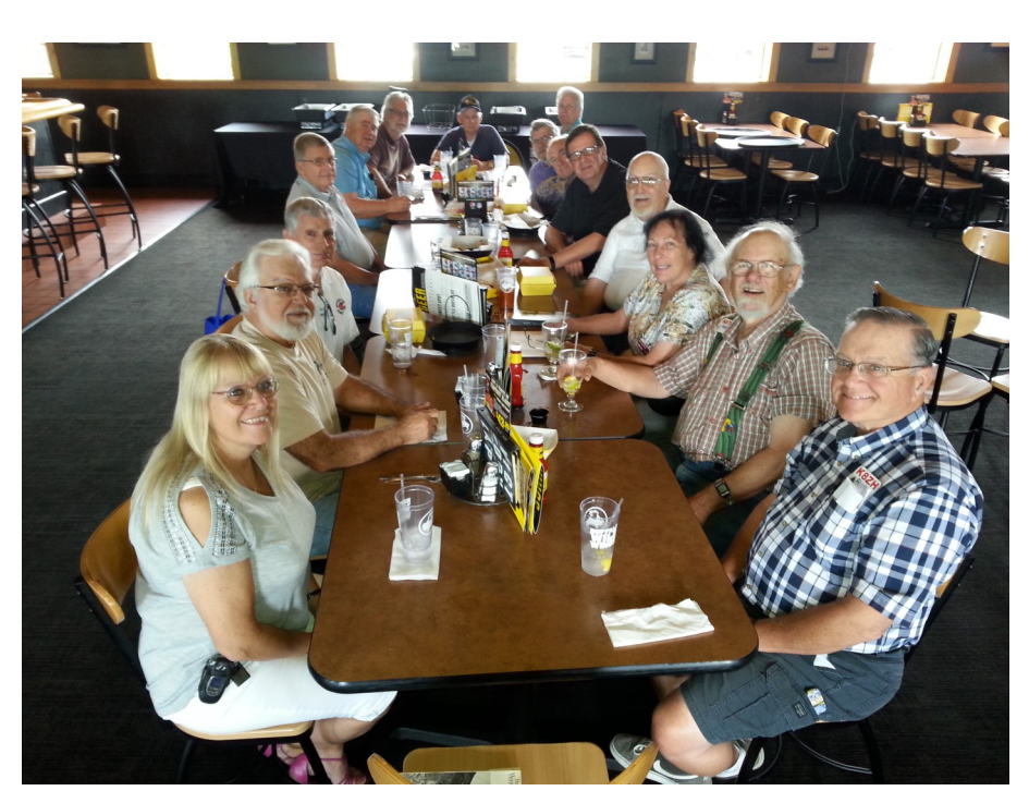
NODXA 2017 Summer Luncheon

That's all for part 1. In upcoming posts, I'll review the other aspects of the radio, including receiver performance, the digital signal processing, and the USB port.