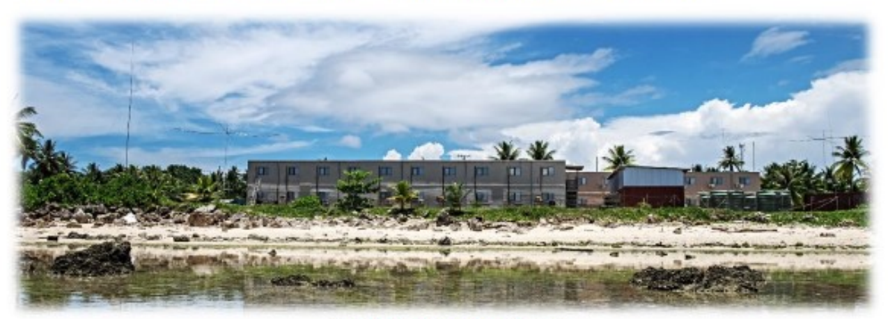
C21WW QTH and antennas

prepare meals for ourselves and for dinner we go to Chinese restaurant.