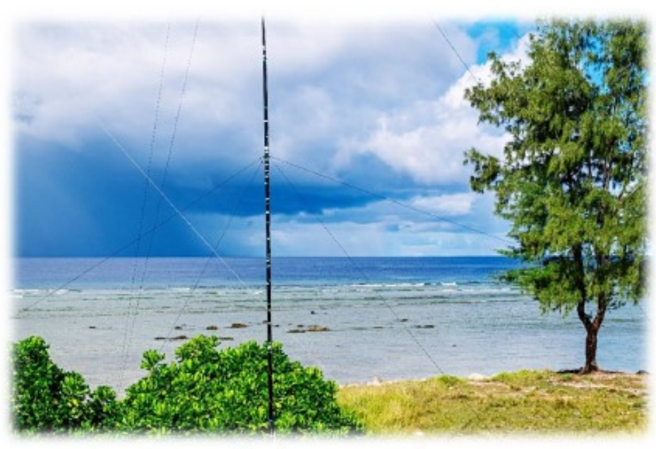
Sea storm on approach

Comparing to western Kiribati the propagation is much better. The QSO daily count also is showing that. In addition. towards beverage USA gives good results, however, we can't set the beverage towards Europe as it was anticipated.