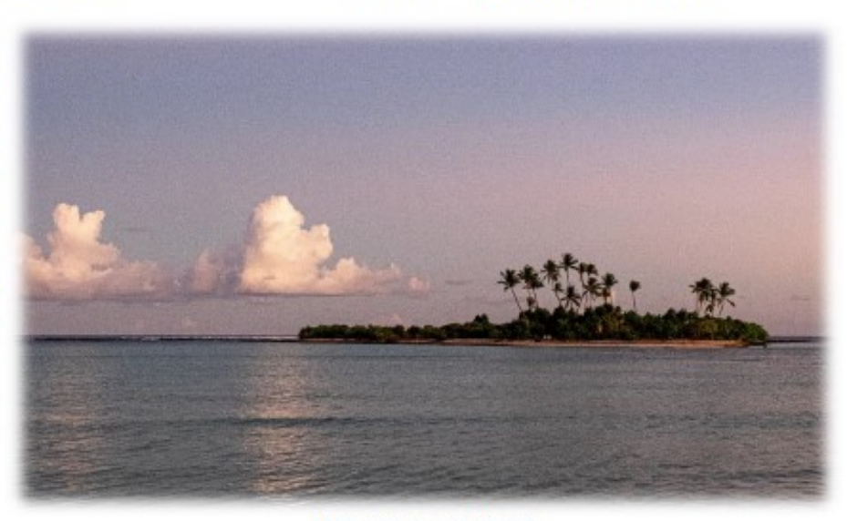
View from our island