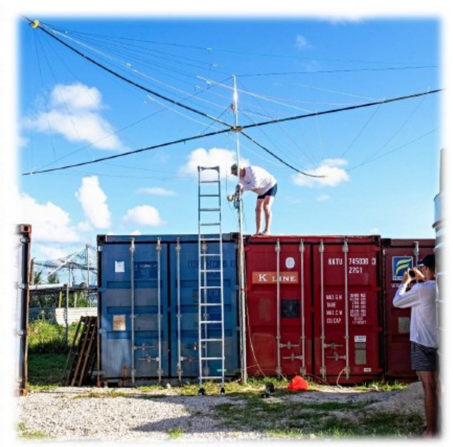
Yuris YL2GM and Kristers YL3JA setting up Spider-beam

Unfortunately, this hotel was not suited for our operations - the rooms were in the middle part of hotel and there was no place for our antennas. On the island there is three more hotels and we head to look for them. In the end, most suitable is Budapest hotel located right on the ocean beach on the North side of the island. Hotel staff is very helpful and we rent 2 rooms there. After today's activities we are very tired so get some sleep.