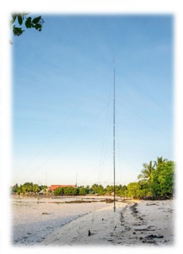
160/80/60/40/30m RA6LBS 18m high vertical

work on 80m during the night, however, the evening comes with an electricity black out and we lose all DXing capabilities. Guest house had a 3kW generator, but the owner wasn't on the site and the mistress had no knowledge how to operate it and also, she could not allow us to work with it. During the night, electricity came back on so we started to operate on low bands mainly with JA and USA, and only some QSOs with EU.