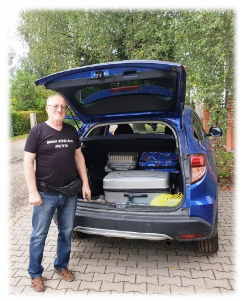
Yuris YL2GM starting expedition journey

First task after receiving license was to book flight tickets for the team. Europe's large airline companies recently have downsized baggage limitations per passenger and for every additional weight unit they charge extra and this increases expeditions expenses significantly. To Brisbane in Australia I chose Etihad airlines and continued by Nauru airlines to Nauru with connection flights middle. To both companies I submitted expedition support applications for