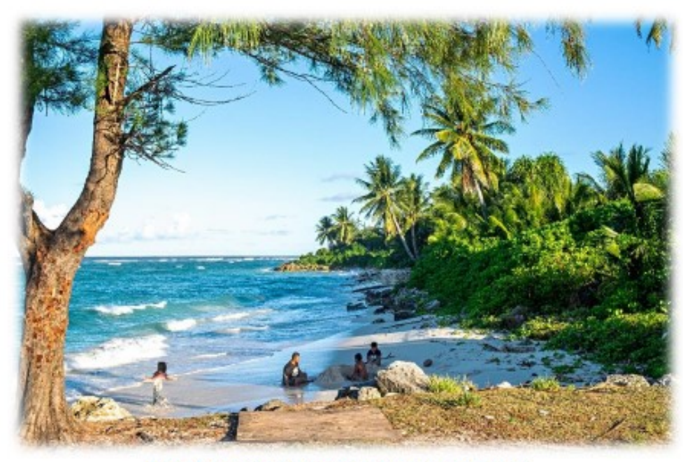
One of many very beautiful sights on the island

Before our flights home we go for a quick sightseeing tour on the island. We visit main and phosphate port mines and after sending postcards home from local post office we catch our plane for Brisbane. There we land around 7 pm. Baggage formalities go by fast and it is delivered to our hotel next morning.