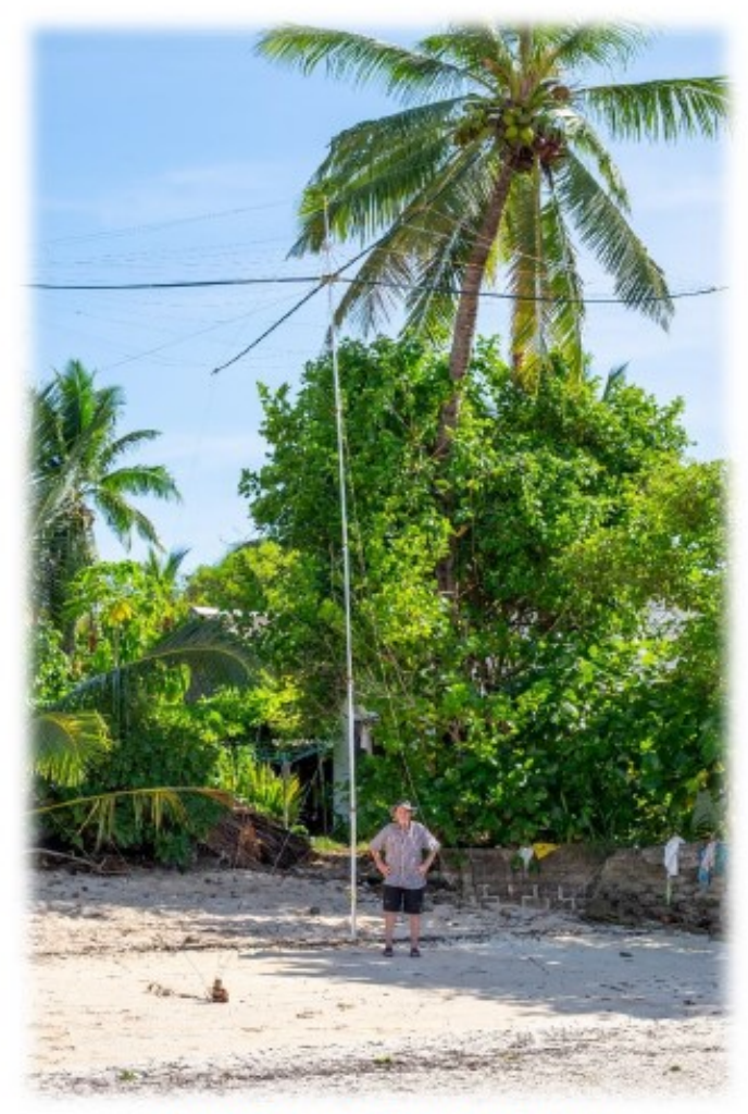
Jack YL2KA and 20/10m Spider-beam

we have crossed our 10 000 QSO mark and again the statistics with Europe has improved to 9.8% of total QSOs. We also manage to make our first QSOs on 10 and 12m, mainly with Japan. As this expedition phase approaches its end, we have to start thinking about dismantling antennas and packing for Nauru.