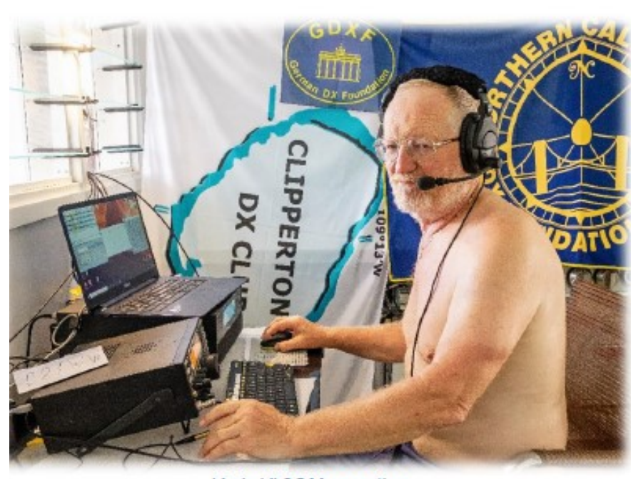
Yuris YL2GM operating

While operating in our usual everyday routine we had some problems with RA6LBS vertical because of humidity that got into communication box and caused high SWR. Monday we will take down and pack antennas. Total in nine days we made 27315 QSOs. Every one of us is tired and longing home. Two DX for locations in one expedition is exhausting.